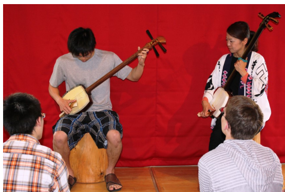
Trying the Tsugaru Shamisen

Expand your Japanese ability in the historic castle town of Hirosaki. Hirosaki Gakuin University's Summer Intensive Japanese program takes your Japanese ability to the next level and allows you to experience Japanese culture first hand. You will spend mornings studying Japanese, and afternoons using your new language to engage with calligraphy, dancing, painting, craft-making and much more. You'll explore northern Japan on weekends with host families. In the end, you will return to the U.S. with great friends & amazing memories.